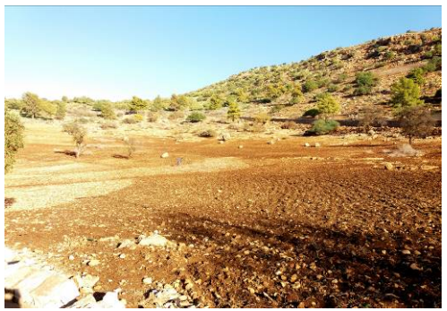
Figure 1. Details from the Studied area (Photo: Velibor Spalevic, 11/2017)

Oued El Abid watershed The study was conducted upstream the Bin El Ouidane dam and is with a total surface of 3119 km<sup>2</sup>, in the high Atlas chain in the region of Beni Mellal Khenifra, Morroco. The drainage area of Oued El Abid is presented on the Figure 2. The Bin El Ouidane Dam accumulates the water comes from two rivers and the water is used for irrigation and hydraulic power production.